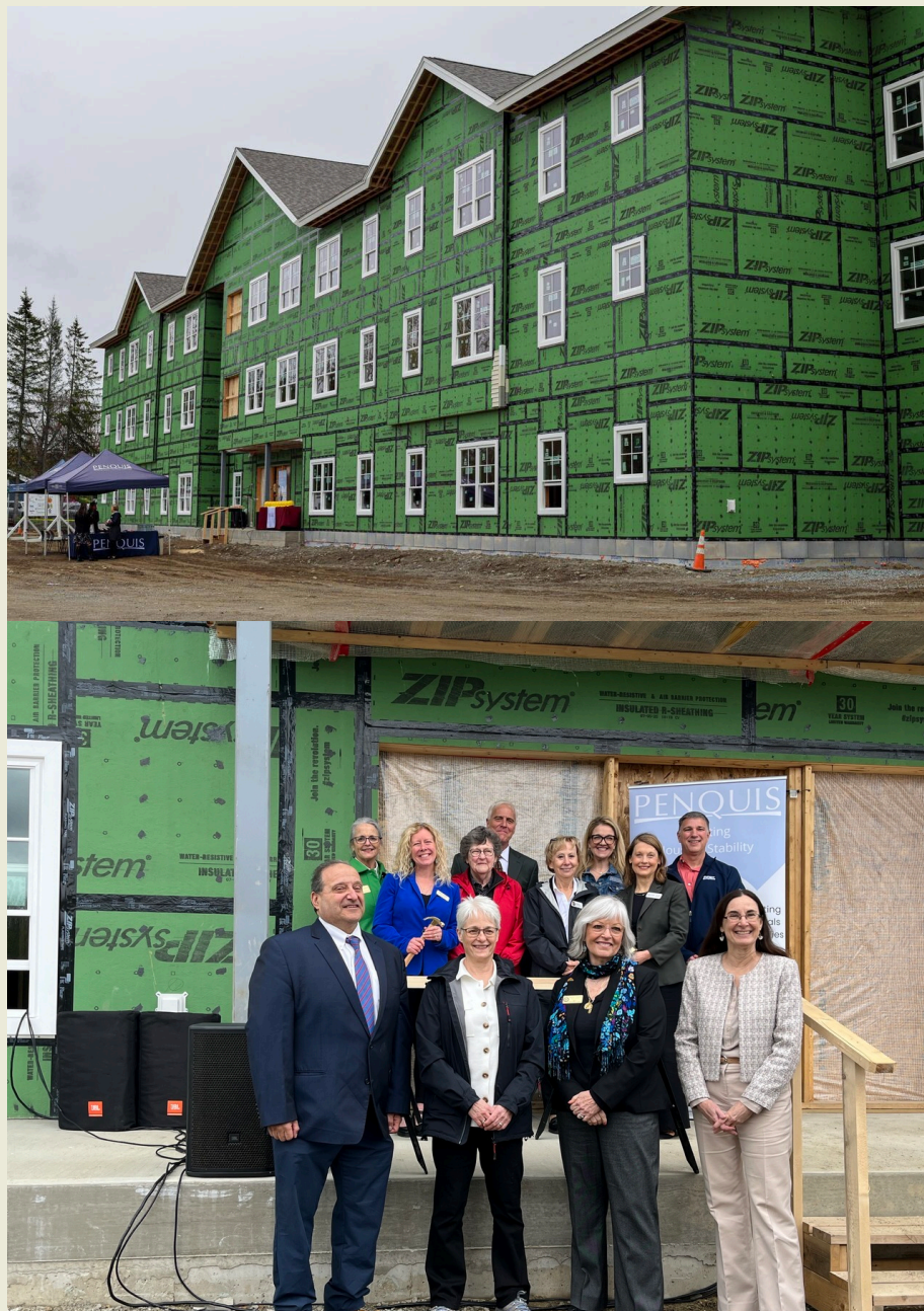
Members of MaineHousing's leadership team traveled to Bangor May 15, to join a construction celebration at Milford Place, a Penquis development that will